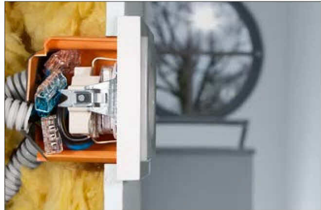
HelaCon Plus Mini fits perfect in every space limited situation.